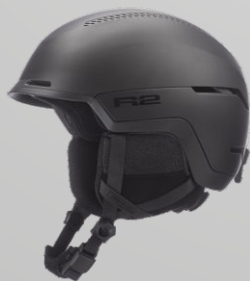
ATHS05A - Octane black / matt (M, L)