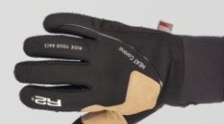
ATR03G - BLIZZARD - 22