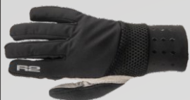
ATR53A - BOND - 25