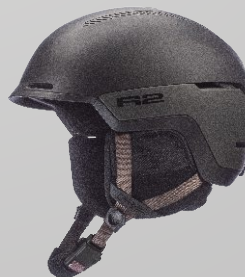
ATHS05D - Octane black, dark green / matt (M, L)