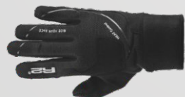
ATR03D - BLIZZARD - 22