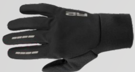
ATR59A - ARCTO - 26