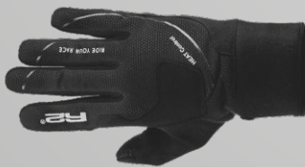
ATR03D - Blizzard