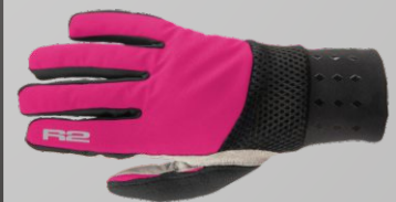
ATR53E - Bond Colour: pink, black, grey Size: S-L