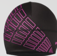
ATK13C - WJING - 31