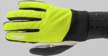
ATR53D - Bond Colour: neon yellow black, grey Size: S-XXL