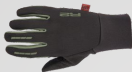
ATR59D - ARCTO - 26