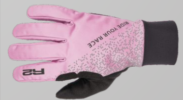
ATR60D - Nexa Colour: powder pink, black Size: S-L