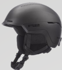
ATHS05A - OCTANE - 10