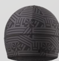
ATK09G - ICY - 29