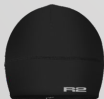
ATK09A - DRIP - 29