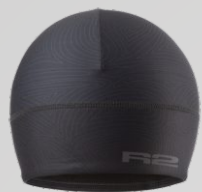
ATK09I - DRIP - 30