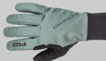
ATR60C - Nexa Colour: lichen green, black Size: S-XXL