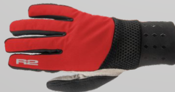
ATR53C - Bond Colour: red, black, grey Size: S-XXL