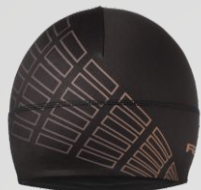
ATK13A - WJING - 31