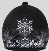
ATK10A - ICV - 30