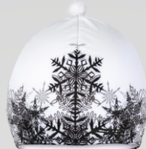
ATK10B - ICV - 30