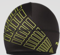
ATK13B - WJING - 31