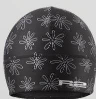
ATK09E - DRIP - 29