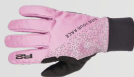
ATR60D - NEXA - 27