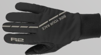
ATR60A - Nexa Colour: black Size: S-XXL