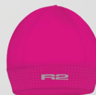
ATK08C - RUBEN - 29