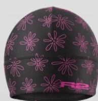
ATK09F - DRIP - 29