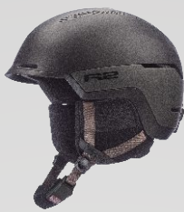
ATHS05D - OCTANE - 10