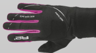
ATR03F - Blizzard