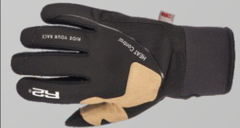
ATR03G - Blizzard