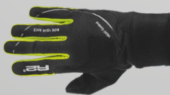
ATR03E - Blizzard