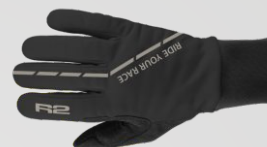
ATR60A - NEXA - 27