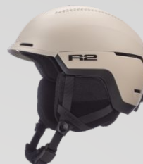
ATHS05E - OCTANE - 11