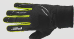
ATR03E - BLIZZARD - 22