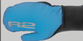
ATR52C - Wrap