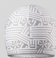
ATK09H - ICY - 30