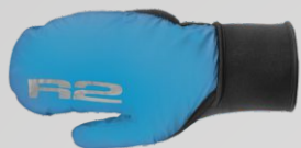
ATR52C - WRAP - 24