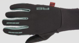
ATR59E - ARCTO - 26