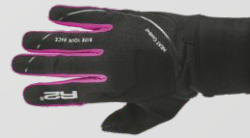
ATR03F - BLIZZARD - 22