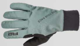
ATR60C - NEXA - 27