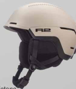
ATHS05E - Octane sand beige / matt (M, L)