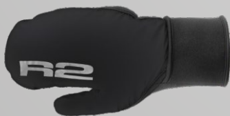
ATR52A - Wrap