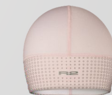
ATK08D - RUBEN - 29