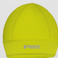
ATK08B - RUBEN - 29