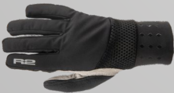
ATR53A - Bond Colour: black, grey Size: S-XXL