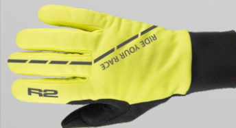
ATR60B - Nexa Colour: neon yellow, black Size: S-XXL