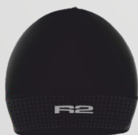
ATK08A - RUBEN - 29