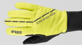
ATR60B - NEXA - 27