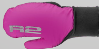
ATR52B - Wrap